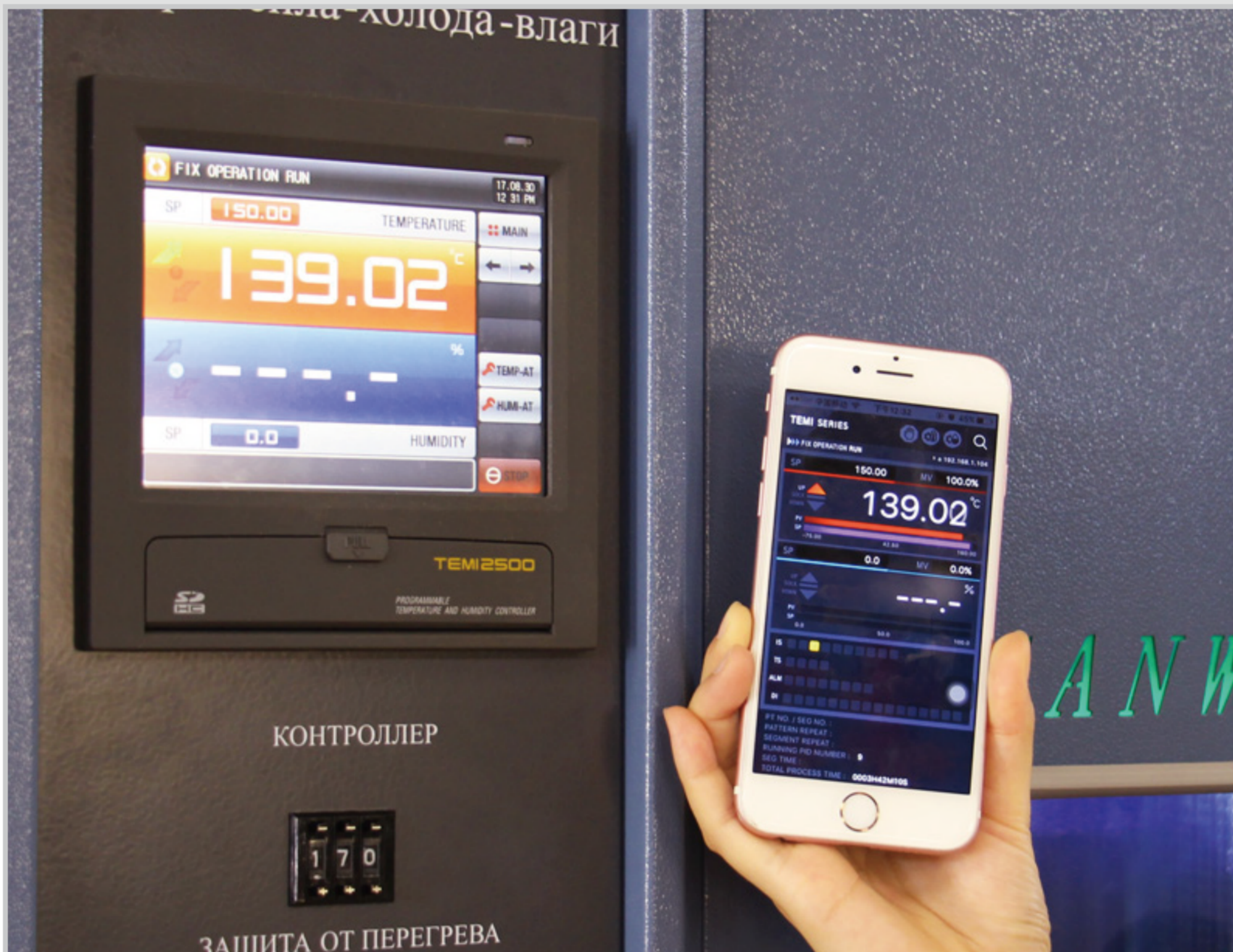
Remote network system