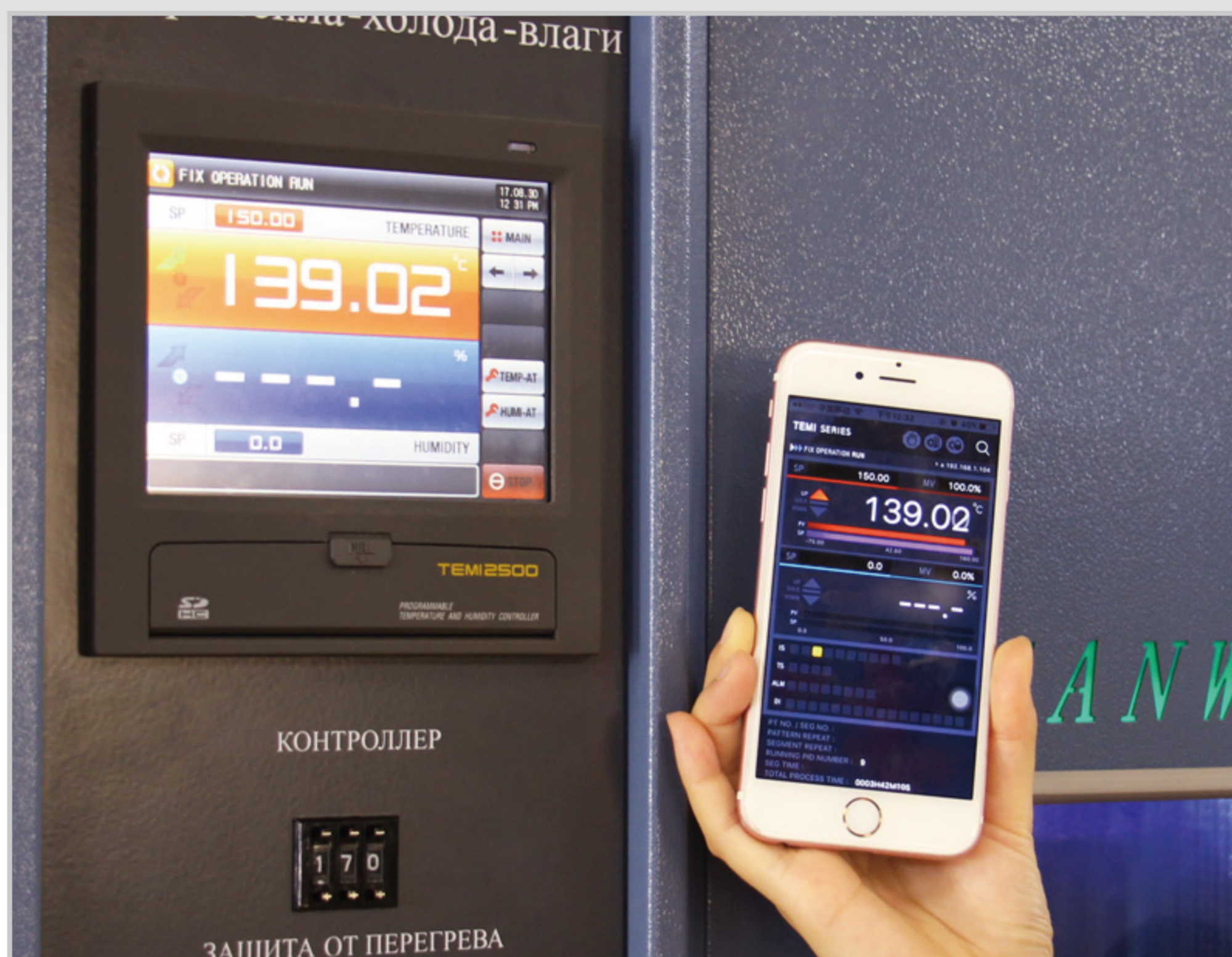
Remote network system