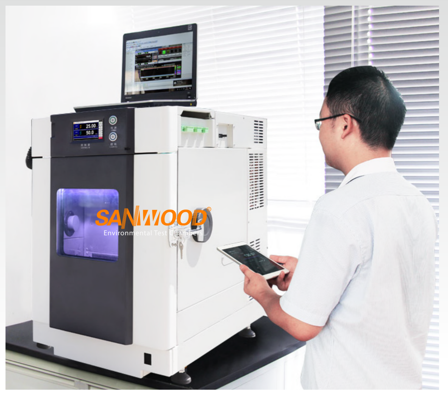
Optimal space use with stand options